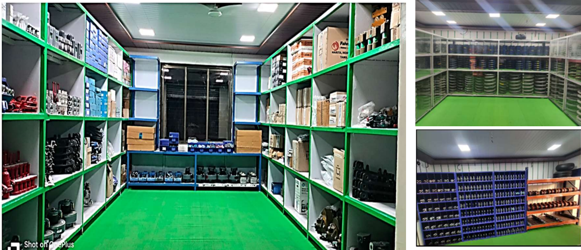
Material storage system at LTT Coaching Depot