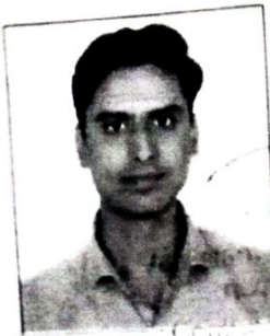
सहायक अधिकारी Personnel Officer मध्य रेल, सोलापुर Central Railway, Solapur.