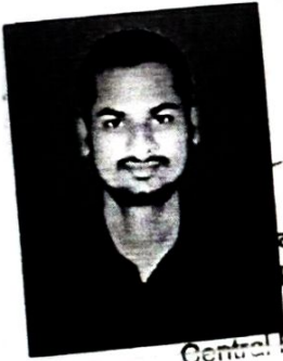
सहायक अधिकारी Personnel Officer मध्य रेल, सोलापुर Central Railway, Solapur.