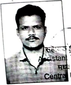
सहायक अधिकारी Assistant Personnel Officer मध्य रेल, सोलापुर Central Railway, Solapur.