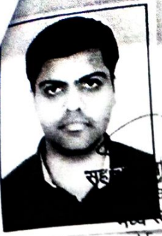
सहायक अधिकारी Personnel Officer मध्य रेल, सोलापुर Central Railway, Solapur.