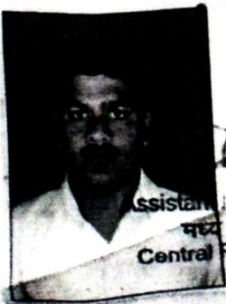
सहायक अधिकारी Assistant Personnel Officer मध्य रेल, सोलापुर Central Railway, Solapur.