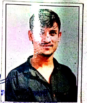
सहायक कार्यालय अधिकारी Assistant Personnel Officer मध्य रेल, सोलापुर Central Railway, Solapur.