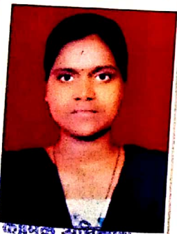
सहायक कार्यालय अधिकारी Assistant Personnel Officer मध्य रेल, सोलापुर Central Railway, Solapur.

C/- Sr.DOM , Sr.DFM/SUR & DRM(P) Raipur for information please. C/- SS/HQR & WD for information and necessary action please. C/- O.O. Cadre, P/File