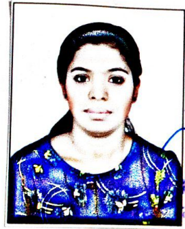
कार्मिक अधिकारी क. रेल, सोलापुर Assistant Personnel Officer C. Rly. Solapur.