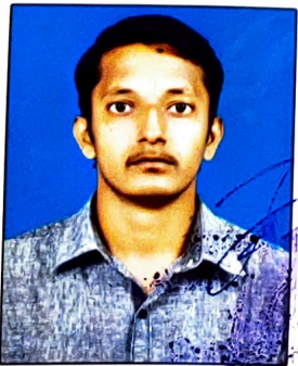
कार्मिक अधिकारी Personnel Officer मध्य रेल, सोलापुर Central Railway, Solapur.

>AboutUs>Divisions> Solapur> Personnel >Office order पर उपलब्ध है ।